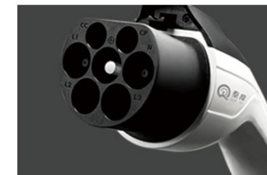
☞ Silver plated gun head